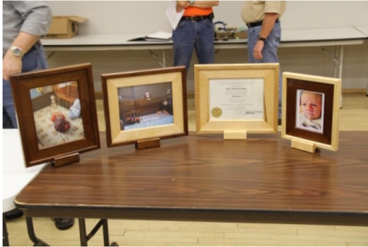
Top Left; Picture Frames by Dan Grimes