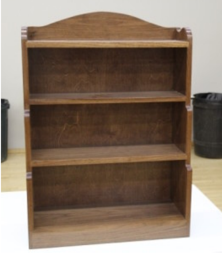
Top Left; Childs Book Case by Reed Craft