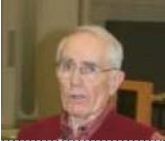
Reed Craft President