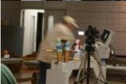
Jack Rolison Starting to turn a hat Upper Left The blank before any work is done Center Above Starting the turning process Above Left: The outside is starting to take shape Center Left: The inside is now starting to take shape Center Below: Finished hat set aside for drying