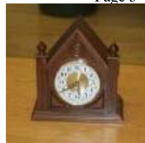
Upper Left: Walnut and Oak Cross by Carl Leavell Upper Right: Walnut Clock by Marvin Widdel