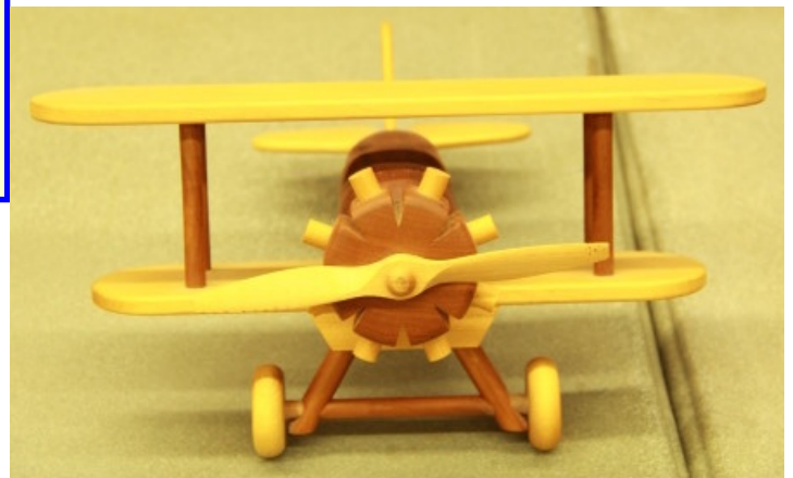
Lower Right Chip Schmidt's Toy Air Plane